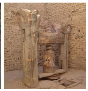
Fig. 19. Abo-Ismail mill restoration one of historic buildings in Al-Qasr.

The Japanese government provided support to restore Al-Qasr city provided that the restoration is made by the same materials that the city was built by, to preserve the architectural heritage as well as to maintain the satisfaction of the people living in the city by bringing the city back to its original style not to damage its archaeological shape. The start of the second last phase of the project is supposed to be in 2018.