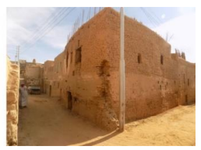
Fig. 17. Homes that are cracked and have a lot of problems in Al-Qasr.

Al-Qasr city suffers from sewage problems affecting the safety of some historic buildings and weakens the foundation of it especially that a lot of these buildings require restoration and support and some other buildings suffer from cracking and partial collapse as shown in Fig. 18. The government will continue its sewage project for the city with a cost estimation of 20 million Egyptian pounds, the project will be opened in 2018 to solve the sewage problem completely.