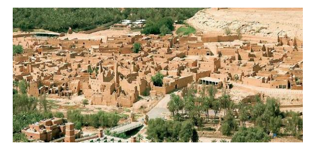
Fig. 5. Altareef district in Aldaraeya [9].