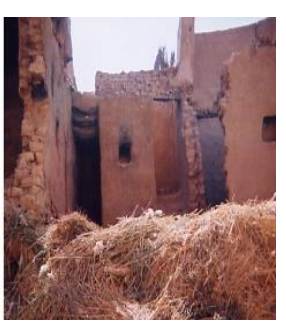
Fig. 16. The city's streets are roofed by wood and palm stools.