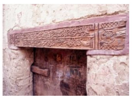
Fig. 9. The wooden sills above the doors with the house construction year [12].

In spite of the unique historic value of Al-Qasr Islamic city, it remained inhabited by people until very recent time that doesn't exceed 20 years, see Fig.10. And after the residents moved to Al-Qasr new city near the historic city, they used it as storage for their old belongings and crops until the ministry of antiquities took off its property from the people in order to preserve the historic city and its houses. Only some blacksmiths and pottery workers still live in their old district in the ends of the city. Al-Qasr new city project includes 200 residential units in Al-Dakhla city in alwadi aljadeed with 45 million pounds cost.