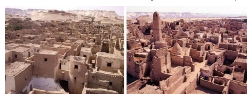
Fig. 15. The urban tissue of historic Al-Qasr.

Different architectural arts were embodied in the architecture of Al-Qasr Islamic city such as religious architecture in Nasr Eldin mosque minaret from the ottoman period as well as funerary architecture such as the grave of sheikh Emad Eldin, the remaining architecture is civil architecture such as houses. Most of these buildings are dated back to the Turkish ottoman period yet this city still has early Islamic monuments traces, there is qibla wall in the southern part of the city dating back to the first hijri century. The Dutch institute delegation found some monuments dating back to the Fatimid era as well as Mamluk period in Al-Qasr city, see Fig. 15.