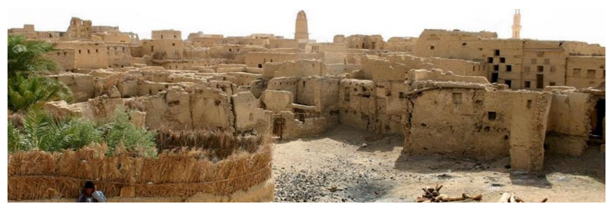
Fig. 18. A part of the old city suffers from neglect, cracking and demolition.

Al-Qasr city suffers from sewage problems affecting the safety of some historic buildings and weakens the foundation of it especially that a lot of these buildings require restoration and support and some other buildings suffer from cracking and partial collapse as shown in Fig. 18. The government will continue its sewage project for the city with a cost estimation of 20 million Egyptian pounds, the project will be opened in 2018 to solve the sewage problem completely.