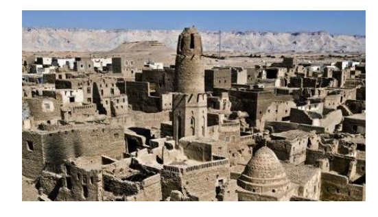
Fig. 11. Nasr Eldin mosque minaret from the ottoman period.