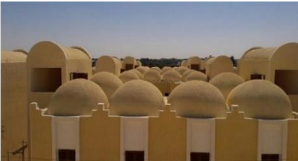
Fig. 10. Al-Qasr new city in Al-Dakhla city in Alwadi aljadeed.