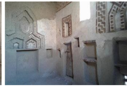
Fig. 13. The house of Mohamed Khatb back to 914 hijri.

The city includes a tomb called "almazoka" that is five kilometres away from Al-Qasr city and is one of the 600 roman archaeological tombs of roman governors that reached this area and dug their tombs in the mountain rocks; it was called "almazoka" for having very bright colours, see Fig. 14.