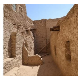
Fig. 20. Project of the restoration of the village using the same building materials and mud brick with popular participation.